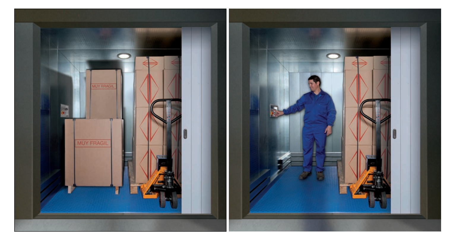
Conventional goods lift mode. The load can take up more space, and the lift is operated from the button displays on the different landings, requiring the presence of an operator on each floor or one moving between landings externally.

The EHmix Lift stands out for its safety features. As is common knowledge, safety is one of the cornerstones of Hidral and its operations. Because of this, it has developed the best safety measures for all of its goods lifts. In the case of the EHmix Lift, the benchmark has been set even higher with the addition of all of the necessary safety features to enable the operator to travel with the goods.